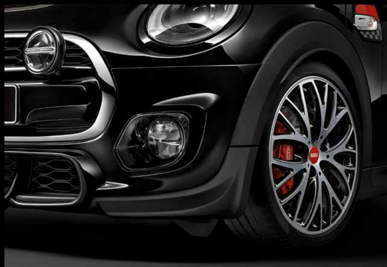
JCW PRO AEROKIT, FRONT SPLITTERS.

Available for the MINI Cooper S 3-door Hatch with Sports Pack and JCW Hatch models. Aerokit without Add-ons for rear spoiler available for the new MINI Convertible with Sports Pack. Aerokit without rear components available for MINI One and Cooper with Sports Pack.