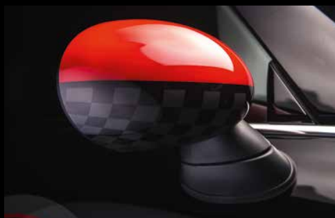
JCW PRO MIRROR COVERS.

51 14 2 354 960 – Left 51 14 2 354 961 – Right