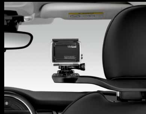
GOPRO INTERIOR HOLDER WITH BASE CARRIER.