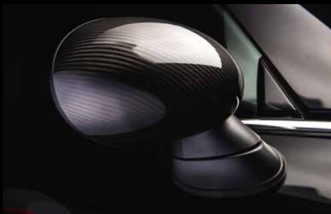
JCW PRO CARBON FIBRE MIRROR COVERS.

In addition to the JCW Aerokit, the Aerokit Plus* is available for the MINI 3-door Cooper S with Sport Pack and JCW models. This includes Add-ons for the rear spoiler, Front Splitters, Rear Splitters, Rear Diffuser, Carbon Fibre Mirror Covers and Air Intake.