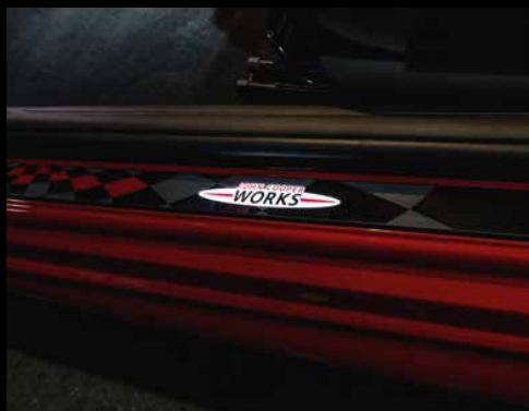
JCW PRO LED DOOR ENTRY STRIPS.

51 47 2 357 729 – 3-door and Convertible