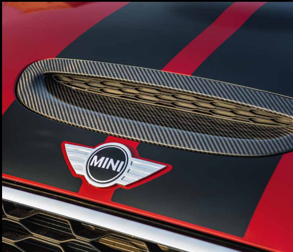
JCW PRO CARBON FIBRE AIR INTAKE.

51 14 2 354 925 – Left 51 14 2 354 926 – Right