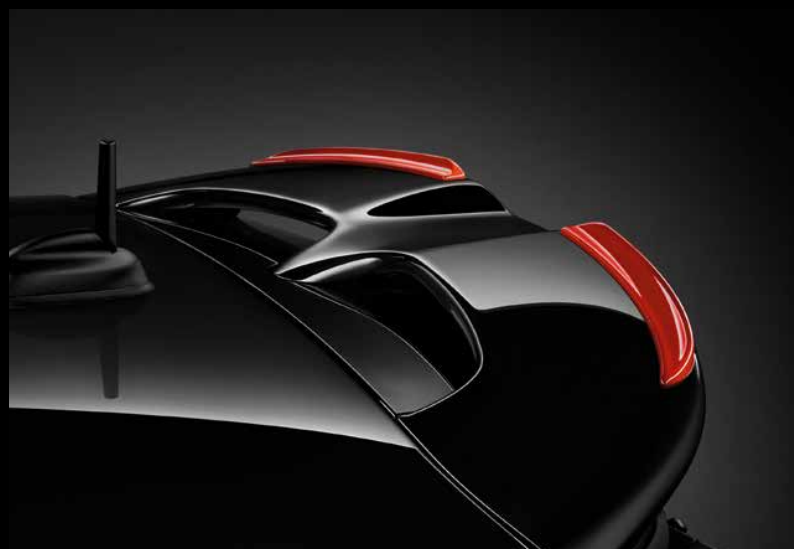
JCW PRO AEROKIT, ADD-ONS FOR REAR SPOILER.