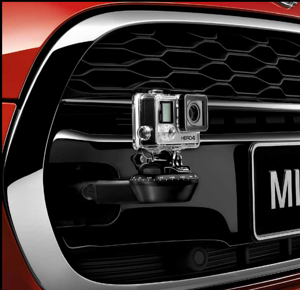
GOPRO TRACK FIX HOLDER.

Capture the moment with interior and exterior GoPro solutions, and match your key to your car with the JCW Pro Key Cover and Lanyard.