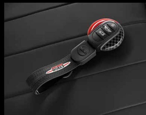
JCW PRO KEY COVER AND LANYARD.