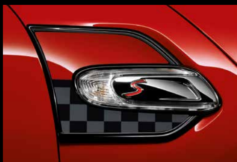
JCW PRO SIDE SCUTTLES.

No matter which MINI you drive, with the JCW Pro MINI KIT exterior styling range you have access to accessories that make your MINI worthy of the racetrack.